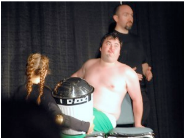
Jabba the Hutt in 10 seconds